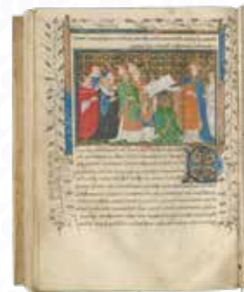
Privileges granted to the University of Caen by Henry VI of England, 15th century

Caen's millennium prompts curiosity and interest in our history as much as it inspires artists. Several exhibitions mark the event and are guaranteed to get you thinking, learning, feeling and marvelling.